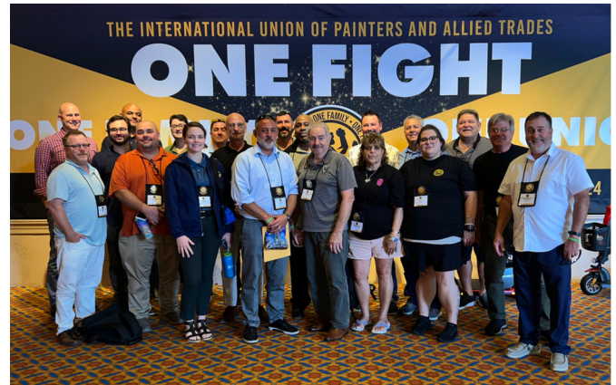
The DC 57 delegation at the 33rd IUPAT General Convention